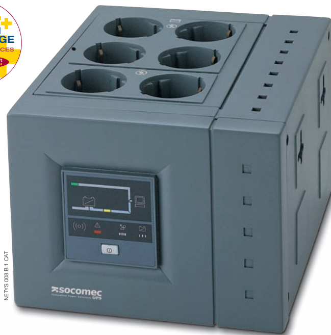
NETYS 038 B1 CAT