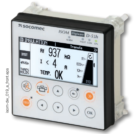
ISOM Digiware D-55h